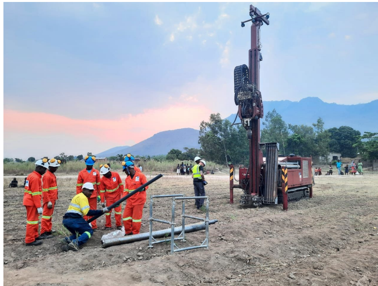
Figure 2 Sonic Rig Drilling Hole No.1