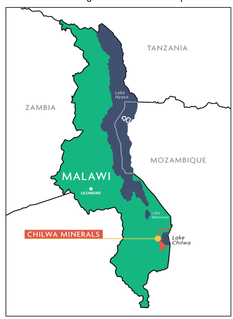
Figure I - Chilwa Minerals Mposa Project Location

The Mposa Deposit accounts for 19.4 Mt of HMS at 4.3%, containing 0.83 Mt THM at a 1% THM cut-off grade, which is 30% of the total Chilwa Project Mineral Resource of 61.6 Mt of Heavy Mineral Sands (HMS) at 3.9% containing 2.4Mt THM at 1% cut off grade over ten known deposit areas.<sup>5</sup>