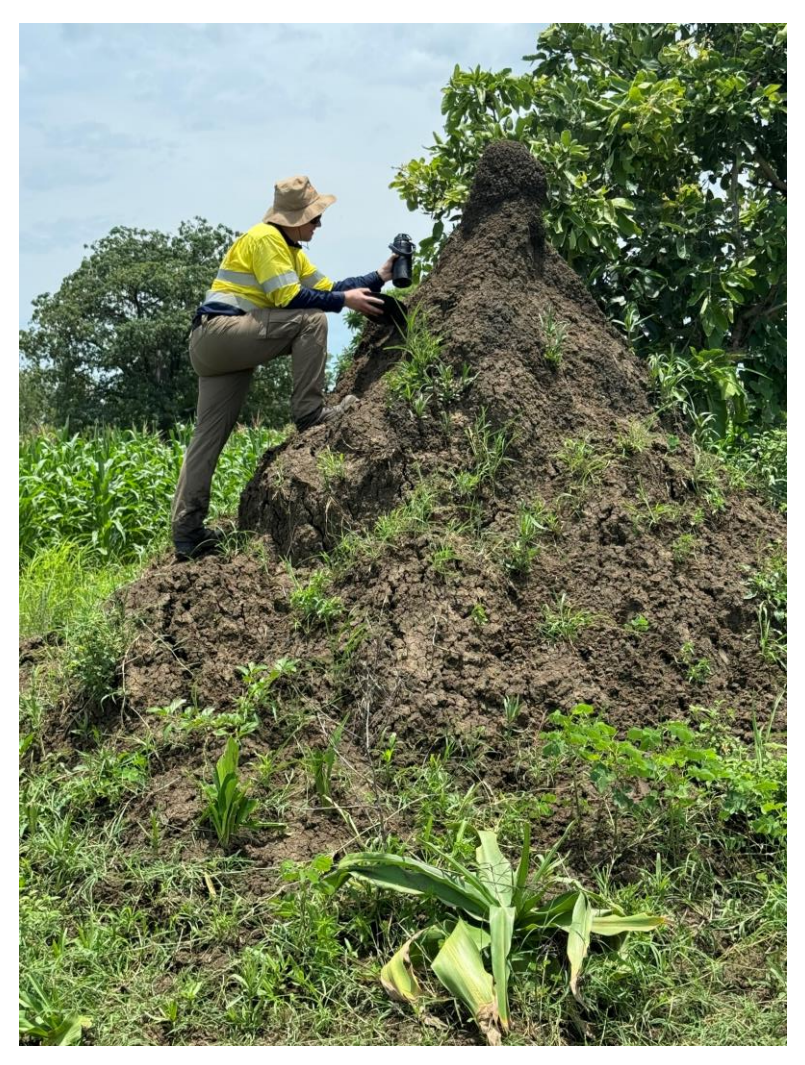
Figure 3 Project Geologist Will Horne at a typical termite mound in the Namasalima region

Initial reconnaissance of Namaslima commenced with testing of termite mounds for early mineralisation indication. The company also commenced community consultation with stakeholders in preparation for mobilisation of the drill rig.