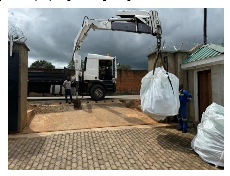
Figure 5: Samples being loaded onto truck for dispatch.