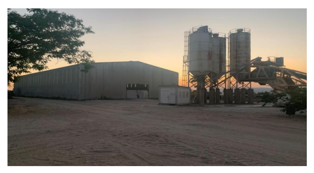
Figure 8: Proposed Storage shed to be utilised by Chilwa Minerals

The Agreement includes the provision of accommodation and office facilities in Malawi, technical and administrative support staff, 4WD and support vehicles and other infrastructure, including a large storage shed which will be utilised for storing samples.