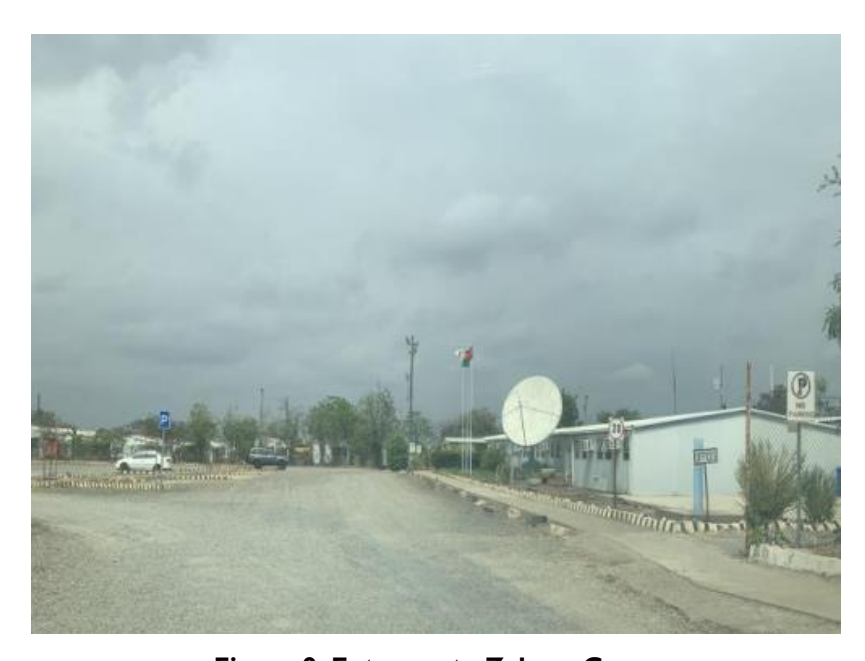
Figure 9: Entrance to Zalewa Camp