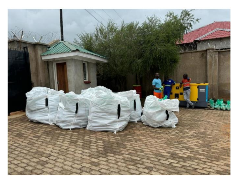
Figure 4: Samples packaged awaiting loading at Chilwa Minerals base in Zomba.